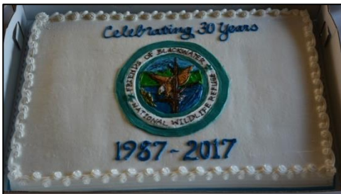
Above: The Friends of Blackwater are celebrating 30 fabulous years as a 501(c) 3 organization supporting Blackwater National Wildlife Refuge. Lots of cake has been going around to celebrate the occasion! This one was served at the Volunteer Recognition Dinner in April!