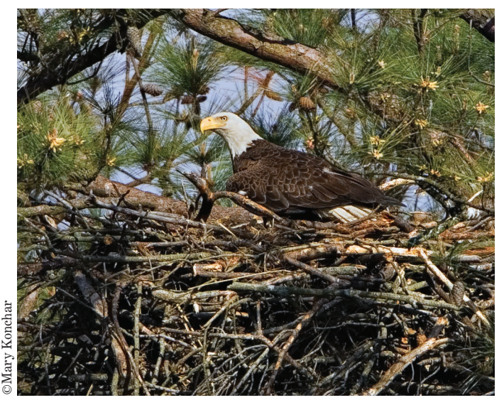
Adult bald eagle in nest

Numerous marsh and shorebirds arrive in the spring and fall, searching for food in the vast mud flats and shallow waters of the Blackwater River. Ospreys, or "fish hawks," are common from spring through late summer and use dead trees and nesting platforms that have been placed in the rivers and marshes.