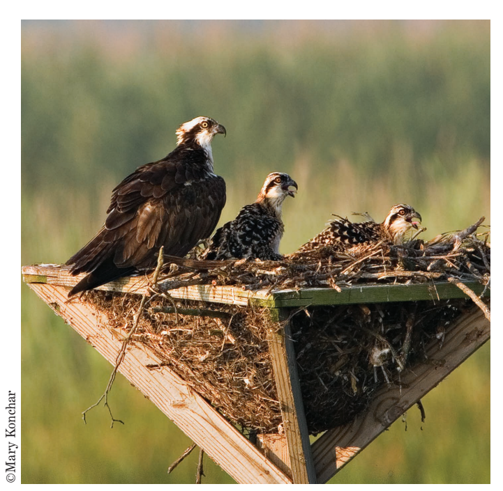
Osprey in nesting platform

along the forest edge. Sika deer, a species native to Asia that were introduced to nearby James Island in 1916, prefer the wet woodlands and marsh. Sika deer are more nocturnal than white-tailed deer and, therefore, are less likely to be seen. Both gray squirrels and Delmarva Peninsula fox squirrels inhabit the wooded areas.